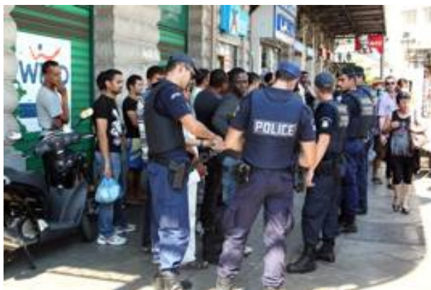
Routine checks in the streets of Athens

In coordinating the need of filling up the detention centres with illegal immigrants, the State announced in August 2012 the (euphemistically named) police operation “Hospitable Zeus”. This is the closest form we have yet of a state-sponsored pogrom, whose aim is to stop, search, intimidate and (if illegal) arrest thousands of immigrants from the streets. Though a continuing operation until this day, the official statistics published by the police itself clearly indicate that the propaganda of an uncontrolled influx of illegal immigration is (apart from racist) grossly exaggerated: out of the more than 90,000 people stopped and searched so far, less than 5,000 have been imprisoned in the camps (not all of which have been detained for lacking legal papers)[8].