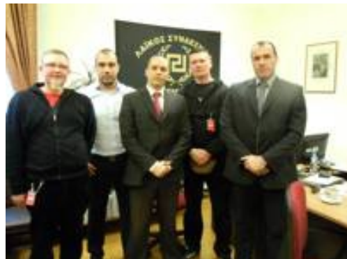
German Nazis getting a tour of Greek Parliament by Golden Dawn.