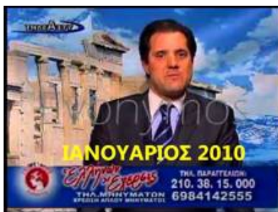
Adonis started his career as a TV salesman.

The first one is Adonis Georgiadis, widely known in Greece for his “career” as a literally hysterical TV salesman of nationalist books (videos here and here ) and a constant figure of ridicule in popular TV shows.