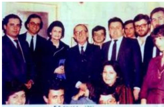
One happy extreme right wing family:

The far right in Greece has a long history and support, one that is particularly visible in specific areas of Greece (especially in the Peloponnese). It was there that the infamous Security Squads (a paramilitary group that openly collaborated with the Nazis) were based and it is there that extreme right wing politics still find a loyal support group. Yet, and especially since the end of the dictatorship, the far right has been more or less assimilated in New Democracy.