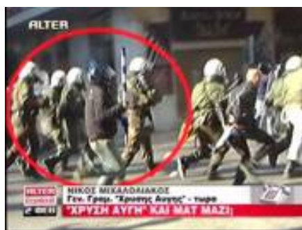
GD members hand in hand with riot cops.

A few months later, GD members staged a demonstration against immigrants who had occupied and were living in an abandoned building in the centre of Athens. At the end of the demonstration, Nazis together with riot cops laid siege to the building and attacked the immigrants and lefties who were inside. The left attempted to calm the situation down (urging the immigrants to refrain from answering the attacks), but a battle erupted. (video link here .)