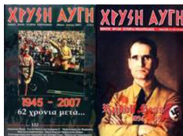
Cover of GD magazine in 2007

Of course, its leader and members try to deny the obvious, or at best claim that they only held such beliefs in their youth, but the Nazi references remained at the forefront of GD's propoganda at least until 2007.