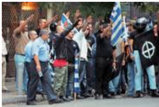
GD members saying hello to their leader

Their reluctance to admit their adherence to Nazism went hand in hand with the rise from anonymity to a recognized political party in parliament. Even for the hardcore extreme right wing of Greece, aligning yourself with the Nazis who occupied Greece and were responsible for the deaths of thousands, is going a bit too far. It is understandable for a small group of thugs and their pre-linguistic mutterings, but it is hardly attractive material for a wide electoral base.