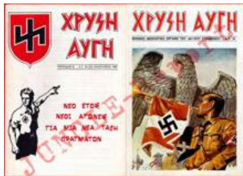
Cover of GD magazine from 1987

From the beginning, there was little doubt that Golden Dawn (initially the name of the magazine published by Michaloliakos) was openly Nazi.