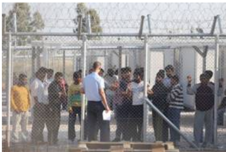
The State's definition of hospitality.

In the same period, the government announced the opening up of new (so-called) "hospitality centres" for the detention of illegal immigrants. Called "concentration camps" by the majority of those who reject them, these new structures were initially part of a proposal by Golden Dawn in its various suggestions about what to do with illegal immigration. Soon after the proposal was taken up by the government, GD started criticizing them, arguing that the existence of the detention centres was nothing but a burden of costs for the State and that the immigrants should instead be dealt in more cost-efficient ways –such as immediately expelling them or placing landmines in the Greek borders.