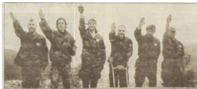
Greek paramilitary volunteers give a friendly salute in Bosnia

The first instance when GD crept out of its anonymity was during the early 1990's, following the protests against Macedonia, a time when nationalism was a la mode , with the government openly sponsoring demonstrations to back up its nationalistic discourse and political agenda. Around the same period, and during the civil war in former Yugoslavia, members of GD enlisted as volunteers and fought alongside Serb fascists, proudly admitting their participation in the slaughter of Srebrenica.