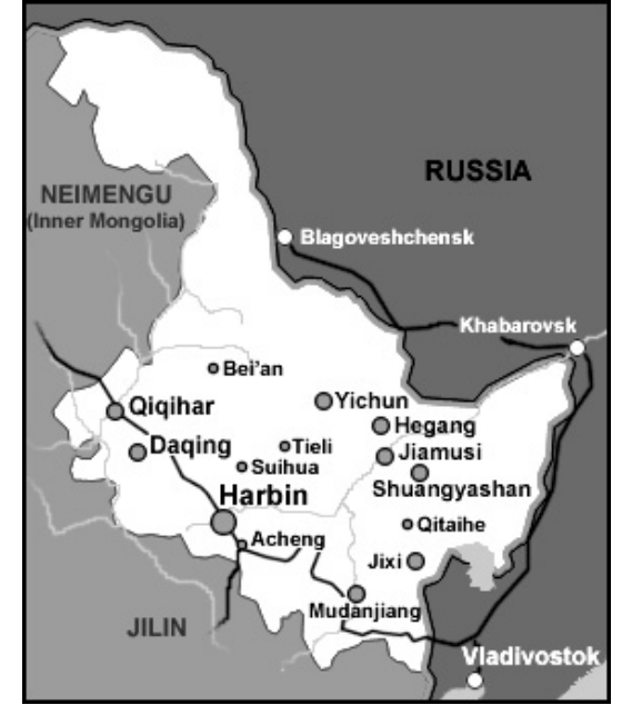
As with the developments that were then occurring in Liaoyang, it was clear to the authorities that the situation was getting out of control. As in Liaoyang, the Daqing authorities responded with a wave of repression. First of all it was announced that anyone still employed who either themselves or had relatives participating in the protests were liable to be sacked. Detachments of the PAP were then sent in to establish roadblocks around the occupied offices of Daqing Oil Management Bureau to prevent demonstrations in support of the occupation. Finally the authorities gave the occupiers a deadline to end the occupation. This brought the occupation, which had lasted several weeks but which was now largely cut off from support, to and end.

In response the xiagang formed an independent organisation known as the Daqing Petroleum Administration Bureau Retrenched Workers' Provisional Union Committee, and on March 1<sup>st</sup> 2002 held a demonstration of 3000 outside the company's Daqing headquarters. Within four days they were able to mobilise more than 50,000 to block trains heading for Russia. Further demonstrations followed, culminating in the occupation of the Daqing Oil Management Bureau at the end of March. The publicity caused by the success and sheer scale of the actions taken by Daqing workers led to solidarity strikes and demonstrations breaking out amongst oil workers across China.