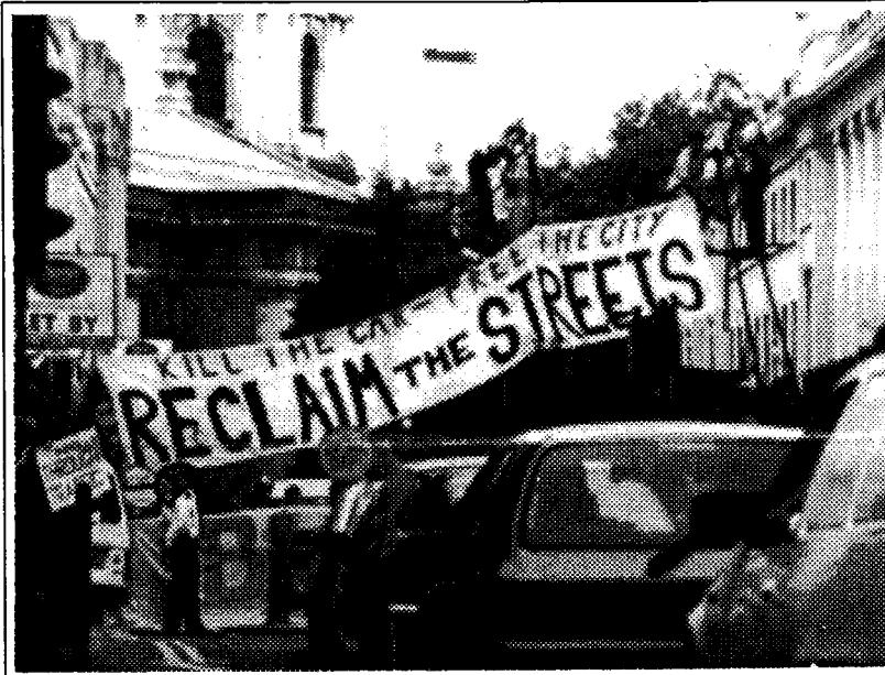
ENERGY is growing for the 16 May global day of Reclaim the Streets parties. As the G8 world leaders meet in Birmingham that day, people world-wide will be banishing the car, dancing defiantly, transforming private space and creating a world wide web of festivals of resistance. Reclaim the Streets, PO Box 9656, London N4 4JY. 0171 281 4621

In an age when politicians in Scotland and elsewhere have been pushing national self-determination, we remain sceptical, critical and internationalist. We hold to the 'big picture' of capitalism, but this is often illustrated by local struggles. As for another 50, maybe not, but we are committed to co-operating with likewise initiatives, globally.