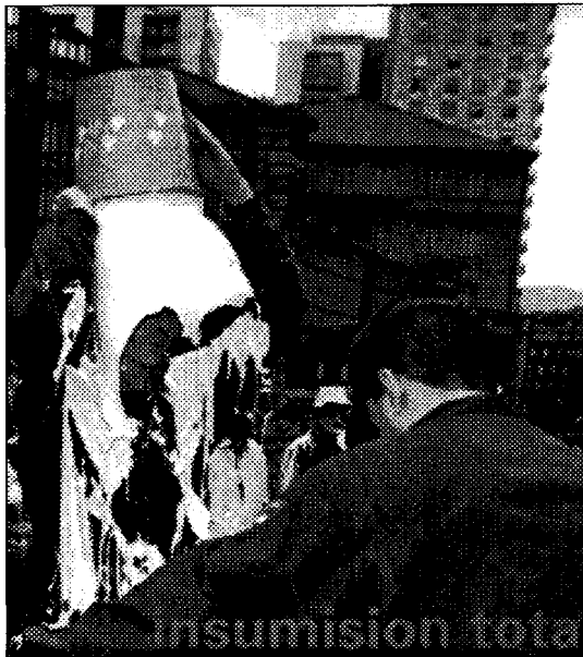
picture from: Insumision total , a pamphlet from People like Us at BM Box PLUP London WC1 3XX for £2 about anti-militarism in Spain and the Basque country.

Meanwhile, the trial on the same charges of Robin Webb, and