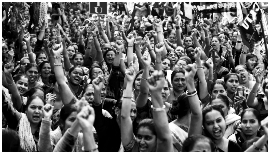
In India, 26 th November 2020, 250 million workers walked out in the largest general strike the world has yet seen.

It is possible to win national gains as tenants. The Poll Tax rebellion built a successful national movement for non-payment, while the 1915 Glasgow Rent Strike saw strong industrial support for tenants and won a national rent freeze. •