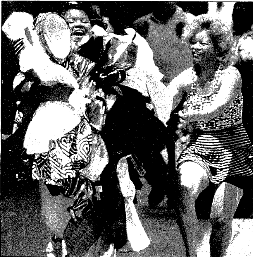
Redistribution of wealth in Los Angeles.