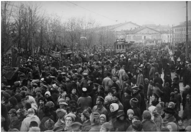
Demonstrations in Moscow marking, top, building workers' and their family members' graduation from a literacy course (mid 1920s) and, above, the fifth anniversary of the October revolution (1922).