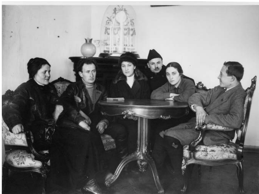
National and regional party leaders. Top: CC members at the ninth party congress (March 1920), including Avel' Enukidze, Mikhail Kalinin and Nikolai Bukharin (sitting, 1st, 2nd and 3rd from left), Lev Kamenev and Evgenii Preobrazhenskii (sitting, 6th and 7th from left) and Lenin (sitting, right). Above: members of the Moscow commission to organise the 'trade union week' (March 1921).