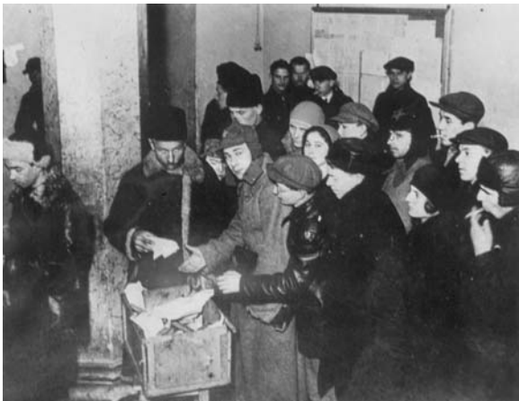
Small privileges amidst scarcity provoked resentment. Top: delegates to the second congress of the Communist International at dinner (1920), while, above, workers had to queue for rations.

party: Chapters 4 and 5 cover the events of mid to late 1921, including the non-party workers' movement that grew after the Kronshtadt crisis, and the first moves towards the NEP. Chapters 6 and 7 cover 1922, when the party moved to refashion its relationship with workers through mobilization campaigns and changes in the unions, while, in the party itself, the contours of groups that would make up the future Soviet ruling class became clearer.