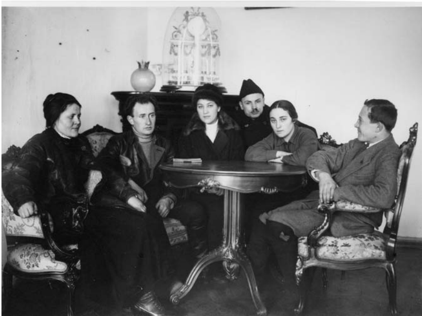
National and regional party leaders. Top: CC members at the ninth party congress (March 1920), including Avel' Enukidze, Mikhail Kalinin and Nikolai Bukharin (sitting, 1st, 2nd and 3rd from left), Lev Kamenev and Evgenii Preobrazhenskii (sitting, 6th and 7th from left) and Lenin (sitting, right). Above: members of the Moscow commission to organise the 'trade union week' (March 1921).