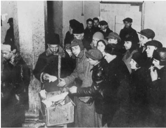
Small privileges amidst scarcity provoked resentment. Top: delegates to the second congress of the Communist International at dinner (1920), while, above, workers had to queue for rations.

party: Chapters 4 and 5 cover the events of mid to late 1921, including the non-party workers' movement that grew after the Kronshtadt crisis, and the first moves towards the NEP. Chapters 6 and 7 cover 1922, when the party moved to refashion its relationship with workers through mobilization campaigns and changes in the unions, while, in the party itself, the contours of groups that would make up the future Soviet ruling class became clearer.