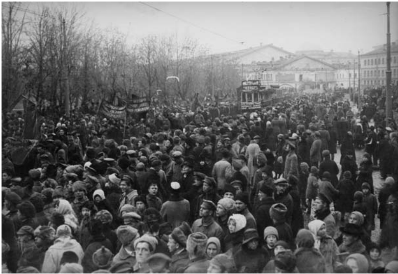
Demonstrations in Moscow marking, top, building workers' and their family members' graduation from a literacy course (mid 1920s) and, above, the fifth anniversary of the October revolution (1922).