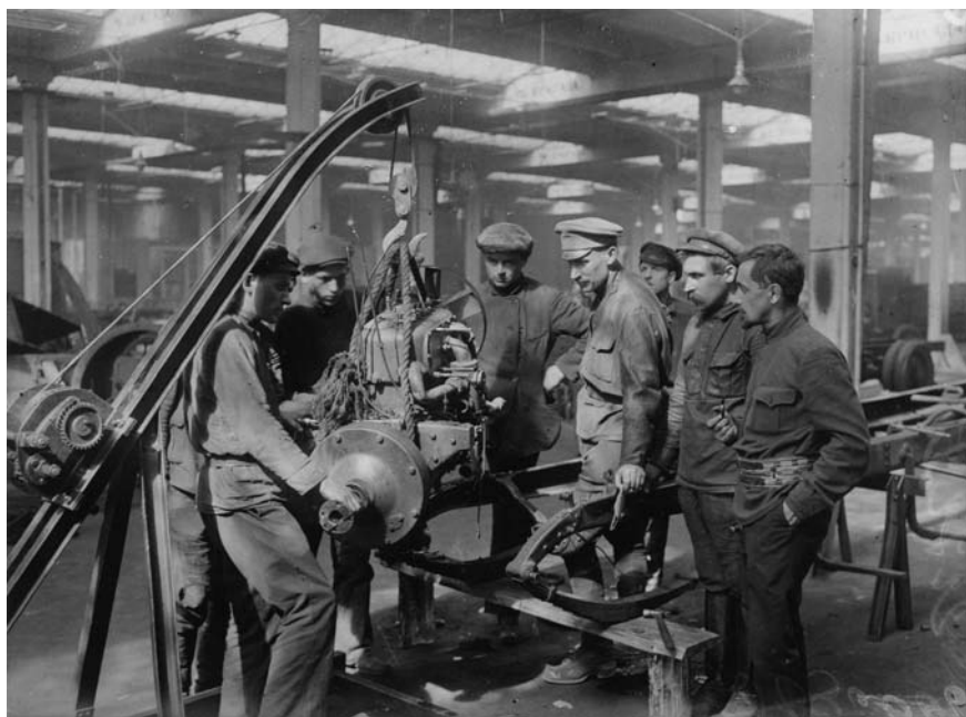
Moscow factory workers. Top: a speaker addresses workers, mostly women, at the Trekhgornaia cotton combine (early 1920s). Above: workers at the AMO motor works discuss an engine repair (1924).