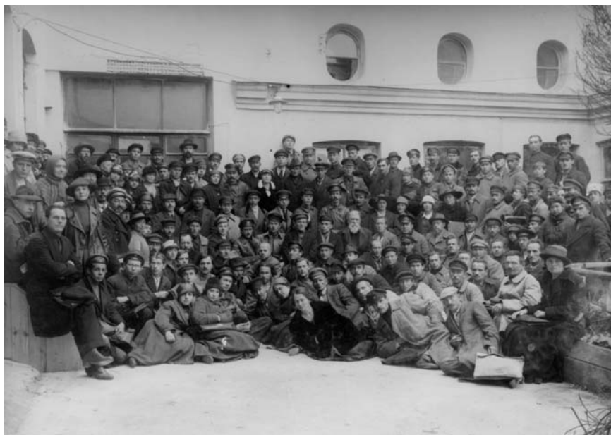
Not so far apart. Delegates to the Moscow congresses of, top, the chemical workers' union (1923) and, above, the union of soviet employees (i.e. sluzhashchie ) (mid 1920s).