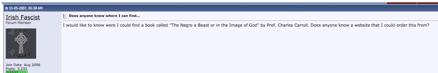
An "Irish Fascist" on Stormfront looking to buy a copy of Carroll's racist tract