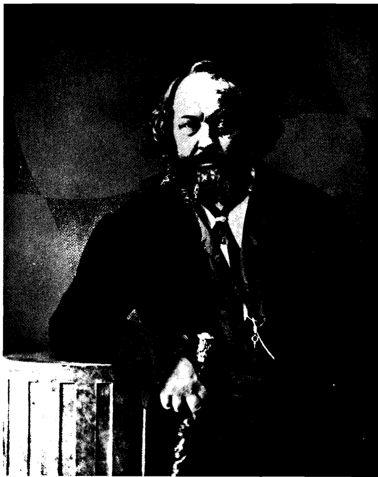
1. Mikhail Bakunin (International Institute of Social History)