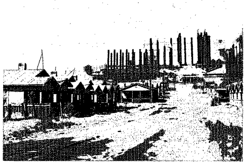
Company suburb: double-tenant shotgun houses line streets just outside Republic Steel plant in Birmingham

or spoken, could lead to eviction. Because rent was so inexpensive (about five or six dollars per month in 1930), few workers chose to strike out beyond the company settlement. More importantly, companies generally did not evict workers unable to pay the rent, choosing instead to retrieve back payments through payroll deduction at a later date. The apparent gesture of goodwill had its price: resident workers living under this arrangement had to work upon request, irrespective of minor ailments or other related problems, and those who failed to show were either threatened or beaten by the company's "shack rouster" or were promptly evicted. Structured along the lines of an armed camp and resembling in some ways South Africa's mining compounds, the company-owned settlements were also intended to insulate workers from outside influences, namely labor organizers. Employers maintained a private police force, paid spies to collect information and monitor workers' activities, and employed every available means to create an impenetrable shield around the community.