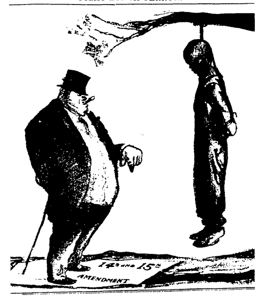
"Fight Lynch Terror!" (Young Worker, 1930)

"Games and Songs for Old and Young" that included an illuminating parody of "Row, Row, Row Your Boat":