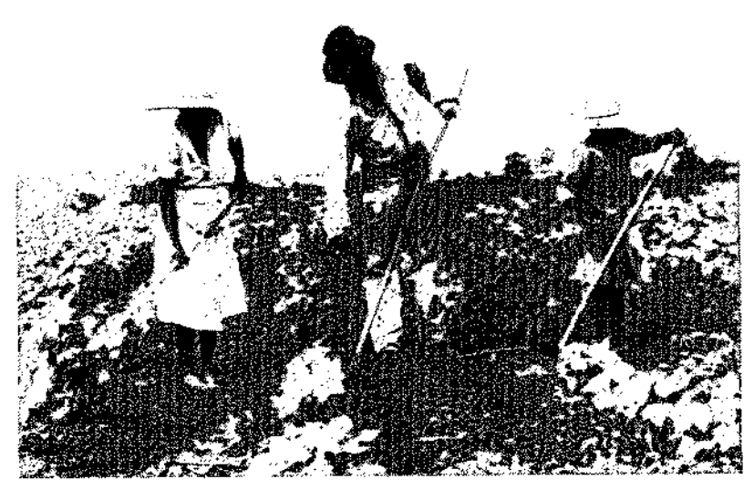
Sharecropping family, near Eutaw, Alabama

the crop at an incredibly high interest rate. The system not only kept most tenants in debt, but it perpetuated living conditions that bordered on intolerable. Landowners furnished entire families with poorly constructed one- or two-room shacks, usually without running water or adequate sanitary facilities. Living day-to-day on a diet of "fat back," beans, molasses, and combread, most Southern tenants suffered from nutritional deficiencies—pellagra and rickets were particularly common diseases in the black belt.<sup>2</sup>