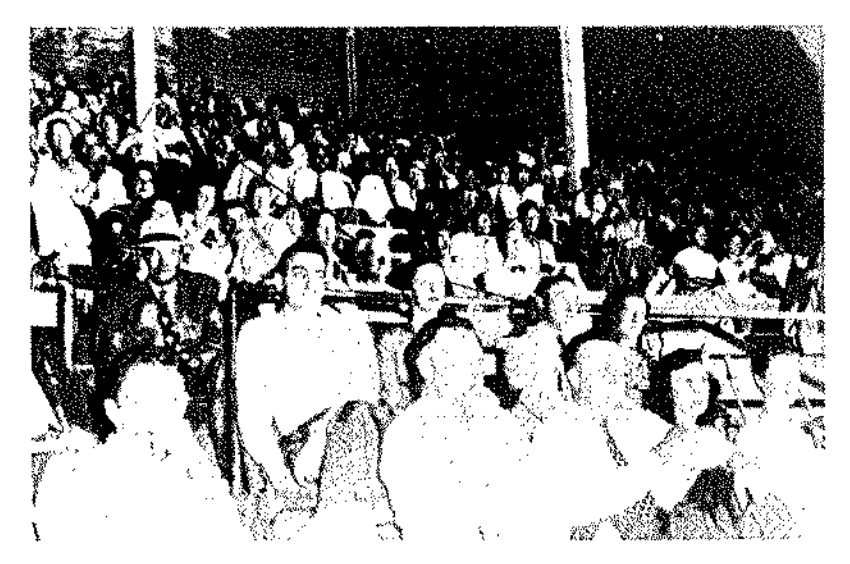
Segregated audience in Montgomery awaits Henry Wallace, 1948. Note the rope demarcating separate seating areas.

Hill censured Bessemer branch leadership for having "assisted Communist-controlled unions in opposition to the CIO."<sup>22</sup>