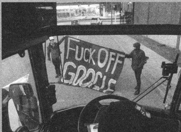
Oakland, December 20, 2013.