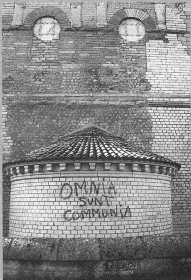
Poitiers, Baptistery of St. John, October 10, 2009.