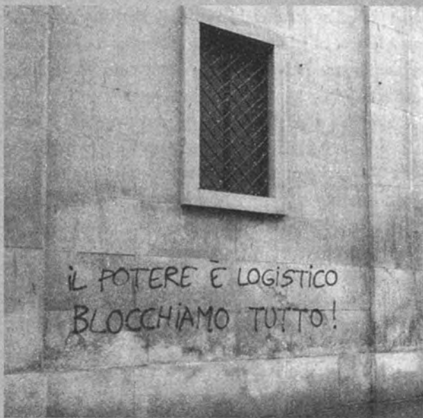
Turin, January 28, 2012.