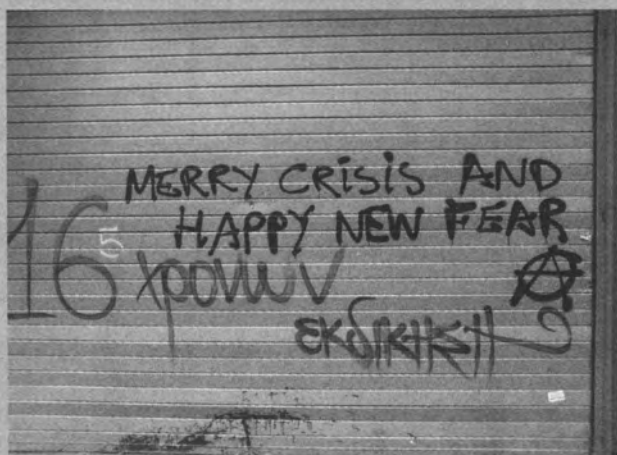
Athens, December 2008.