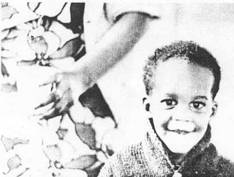
Breakfast every day is where it's at