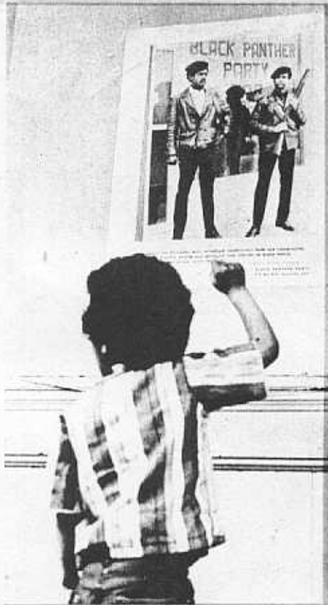
Power to Huey P. Newton

How is the Black Panther Party working out of bed at approximately 6:30 a.m. on school days. They cook and prepare the food, they direct the children across the street. The breakfast has been attended to the community from the merchant community, to see that it is constantly supplied