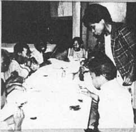
Whatever we do is to serve the People

... fast for children pro- ... c program, designed to ... institutions in a society ... o serve the masses, not ... In America this program ... capitalist America any ... bsolutely free is con- ... s. The Black Panther ... rd organization and a ... n educates by example, ... party is educating the ... at they have a right to ... technology and human ... e. ... gs to all the people."