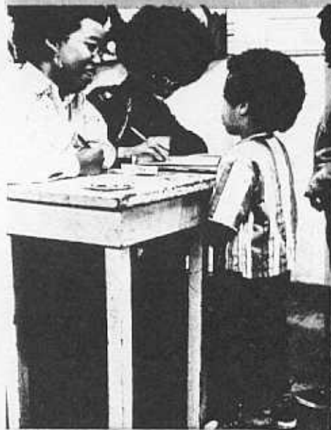
Lil' brother checking in for breakfast