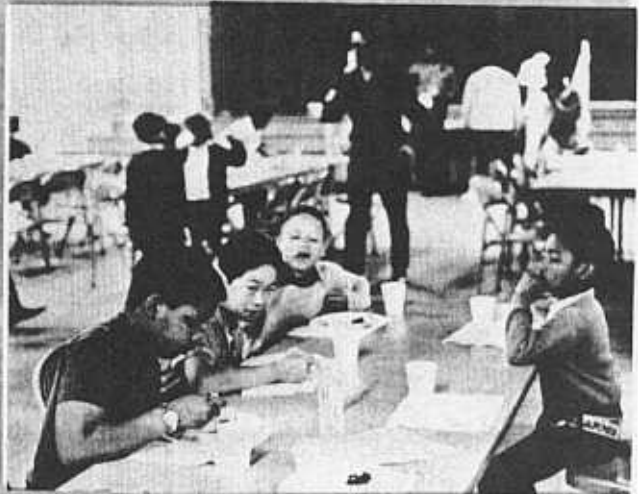
Free breakfast is for all children

... children program? The ... stion need be answered ... along to the upper or so- ... The majority of Black, ... Orientals and poor ... elr American experience ... le to obtain and sustain ... one has to attend school