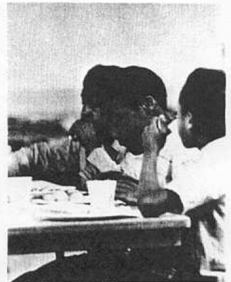
This is the first of many Free Programs