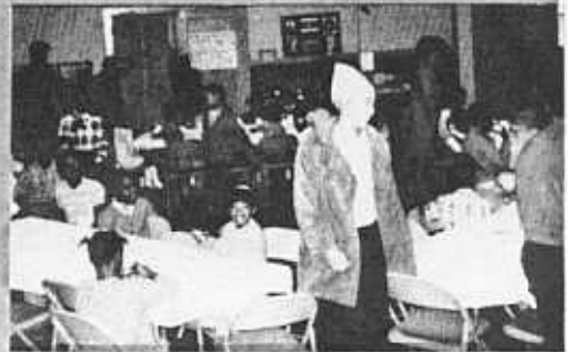
Sisters on their job