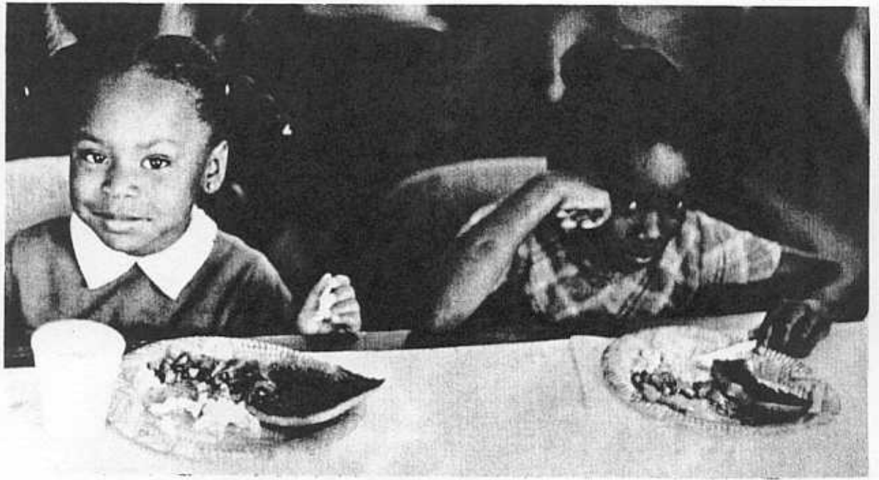
The Black Panther Party understands children need nutrients everyday