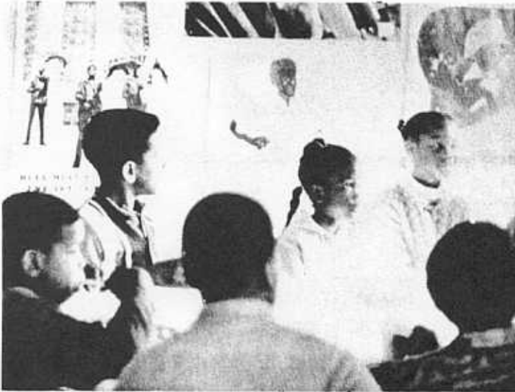
After a hot breakfast they will learn if anything is taught