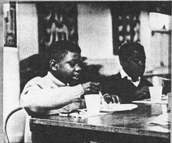
Grits, eggs and bacon is what's happening