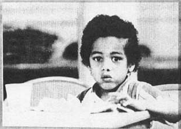
With Free Breakfast for Children little brother won't be little long