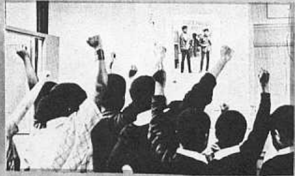
and Bobby Seale and the Panthers