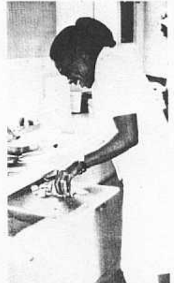
Happiness is serving the People