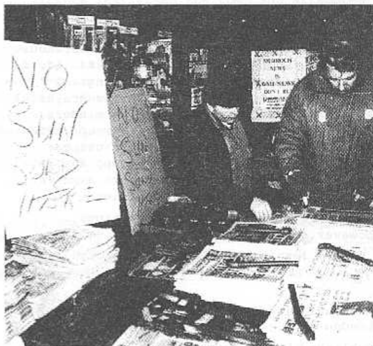
Discerning news vendor at King's Cross