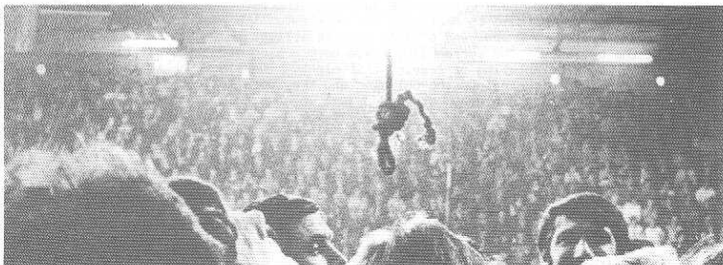
1984: South Wales miners receive Willis

Picketing printworkers are right now organising to defeat the current combined attempt by the company/police/officials to stop the picketing. The job remains to clear the roads from Wapping, 100% entry to Wapping and to clear the police from the area. For that, reinforcements are needed. Fellow workers - the road to Wapping is the road to your freedom. Join us.