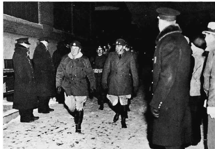
NATIONAL guardsmen, called in to relieve city policemen at Strutwear, December, 1935