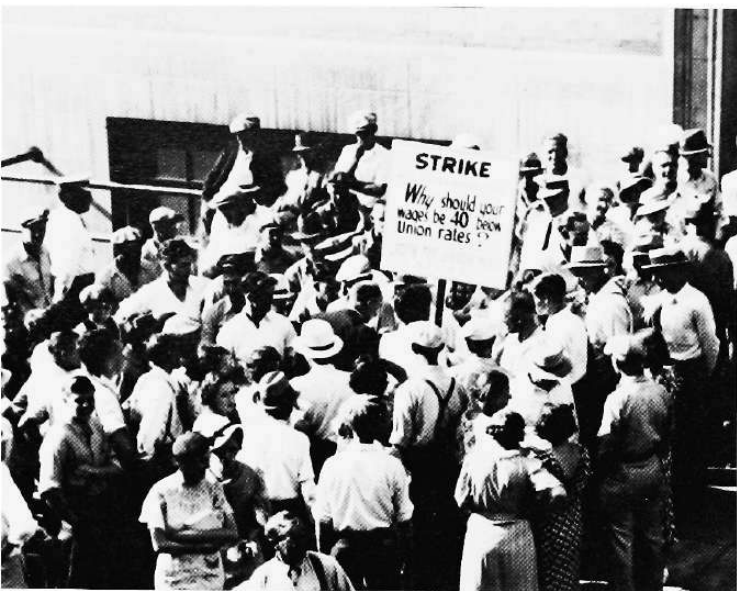
ANGRY pickets and their supporters milling around the gates of the Strutwear plant in 1935, early in the course of the strike

General Drivers Local 574—helped weld these strikers into a tight organization throughout the ranks of the Strutwear workforce. 29