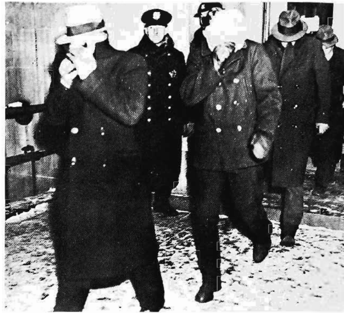
STRIKEBREAKERS, concealing their faces to avoid being recognized by pickets, departing the Strutwear plant under police protection, 1935

Together, Belden's committee and Strutwear management filed suit against the governor, the mayor, and E. A. Walsh, adjutant general of the Minnesota National Guard. The businessmen decried "the practice of public officials utilizing either police or militia to deprive citizens of their constitutional right to work," and they sought an injunction to remove the guard. They also launched a public pressure campaign, fighting the